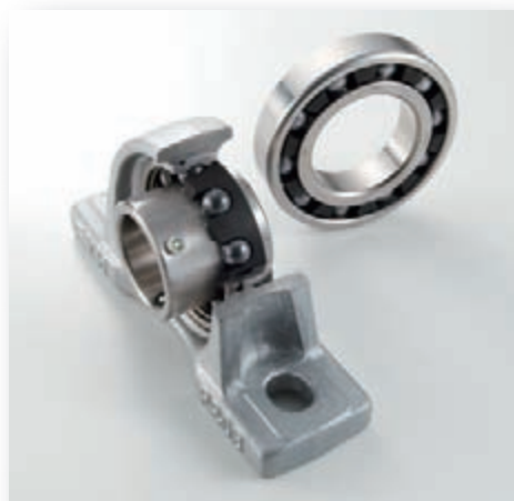
CERAMIC BALL UNITS Hybrid Bearing Units for Special Environments