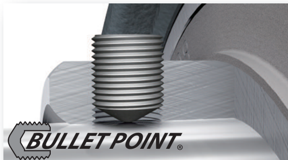
BULLET POINT Original Setscrews for severe vibration and high speed