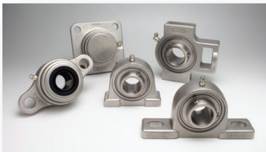
STAINLESS UNITS The corrosion resistant units

We produce a broad range of mounted bearings from small lightweight units to large heavy-duty units to meet a wide variety of industries and applications worldwide.